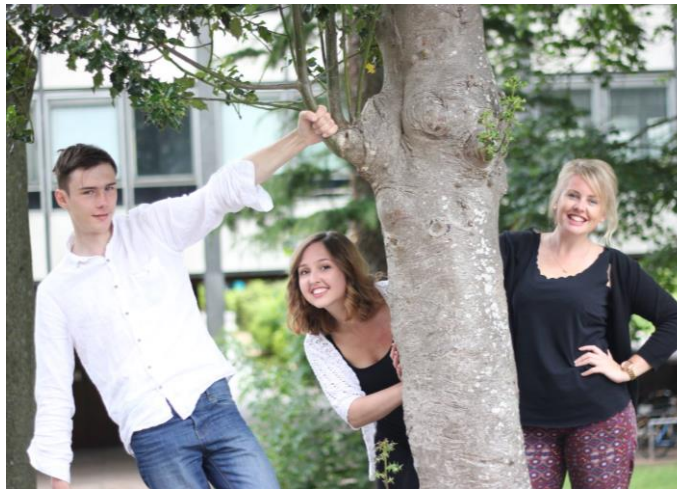
Young people' s champions involved in the core standards project.